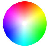
LED Mood Lighting & Separate Control